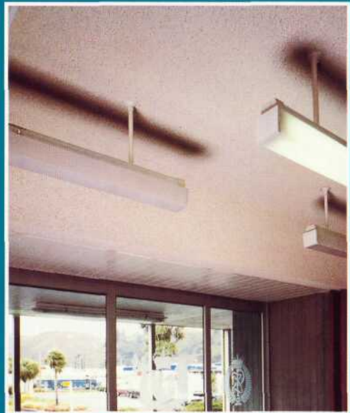
WHITE WHISPER Commercial application