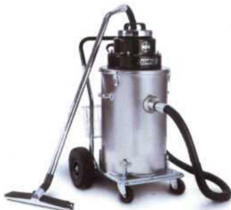
HTC 21 W

Handy add-on packages available for: natural stone - polished concrete - cleaning - wood