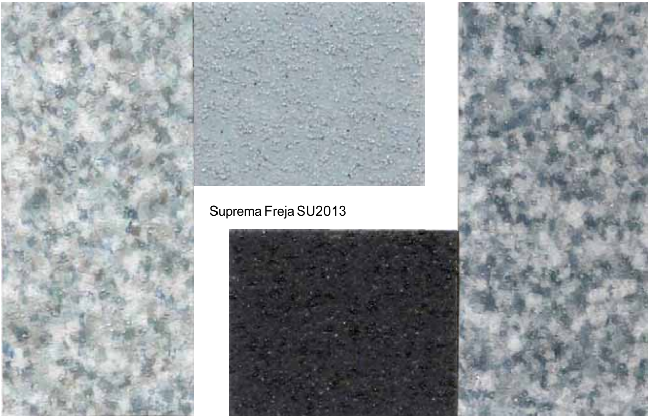
Suprema Freja SU2013