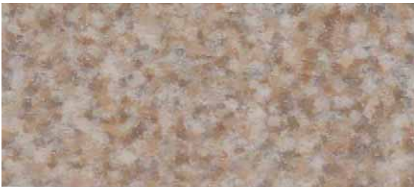
Mirica Minotaur MC2006