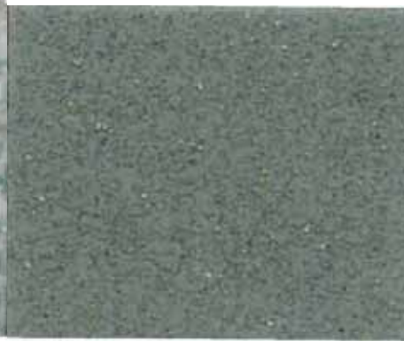
Suprema Poseidon SU2003