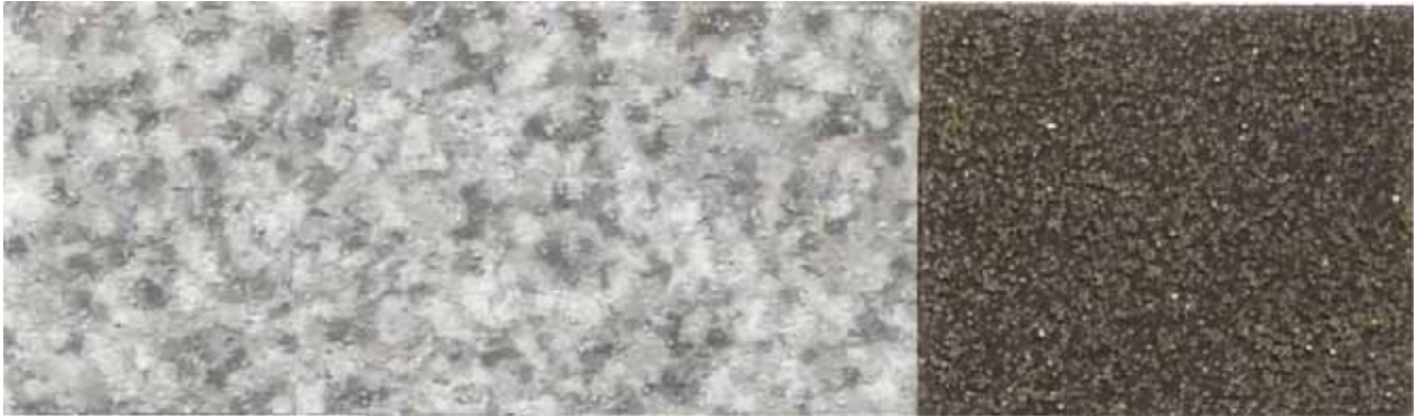
Mirica Unicorn MC2001