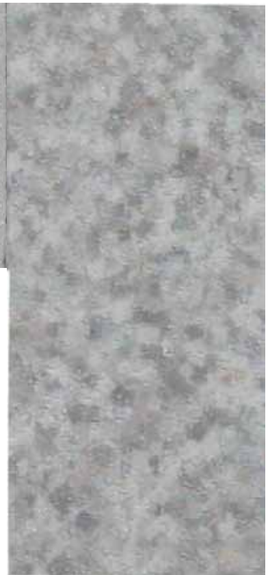
Mirica Phoenix MC2005