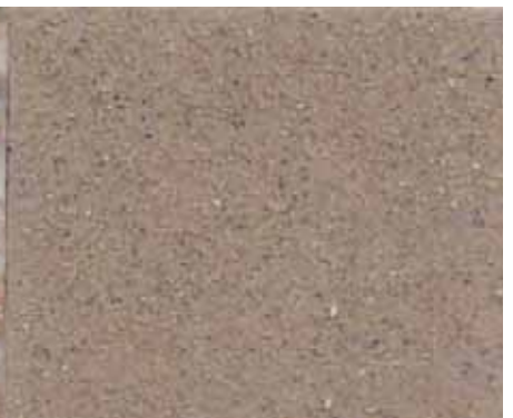
Suprema Ull SU2019